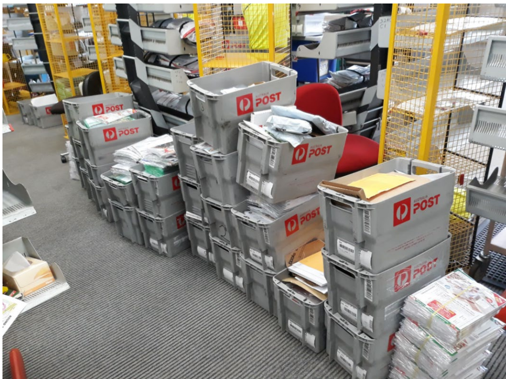
An example of a traditional postie round being left behind, undelivered, on the day delivery was due