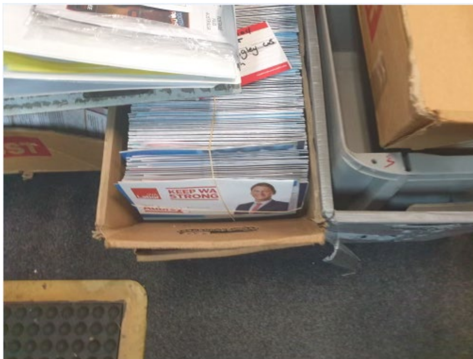
Election material booked for UMS delivery remained undelivered in a northern Perth suburb on 15 March – the Monday after the election had occurred.

The delay in delivery can range from days to weeks after they are due, or in the case of some unaddressed mail products – not delivered at all. It has caused a situation where posties say, it is impossible for them to actually catch up – meaning, so long as the model remains in force, delays continue to grow.