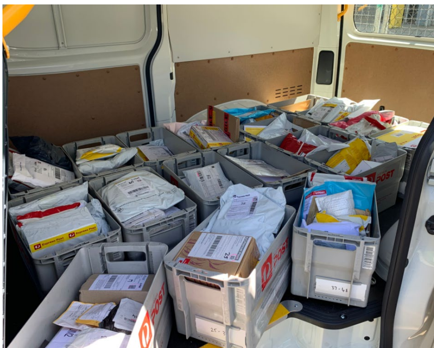
A typical load from a parcels-postie's van – nothing exceeding the size or weight to that delivered by traditional posties pre-ADM, or letters-posties post-ADM

Furthermore, the volume of parcels being streamed to third party contractors has increased exponentially. This includes the volume of articles streamed to those parcel contractors who are engaged directly by Australia Post – who are routinely rejecting volume as they themselves are overextended. But this also includes other third parties who have only been engaged under new initiatives since the introduction of ADM – taxi drivers and drivers working on behalf of ride-sharing platforms, delivering ordinary parcel articles at a premium cost.